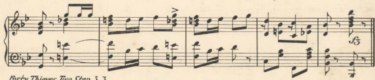
Forty Thieves Two Step 3.3.