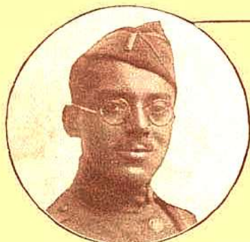
LIEUT. NOBLE SISSLE