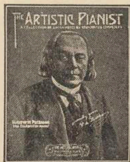
VLADIMIR DE PACHMANN