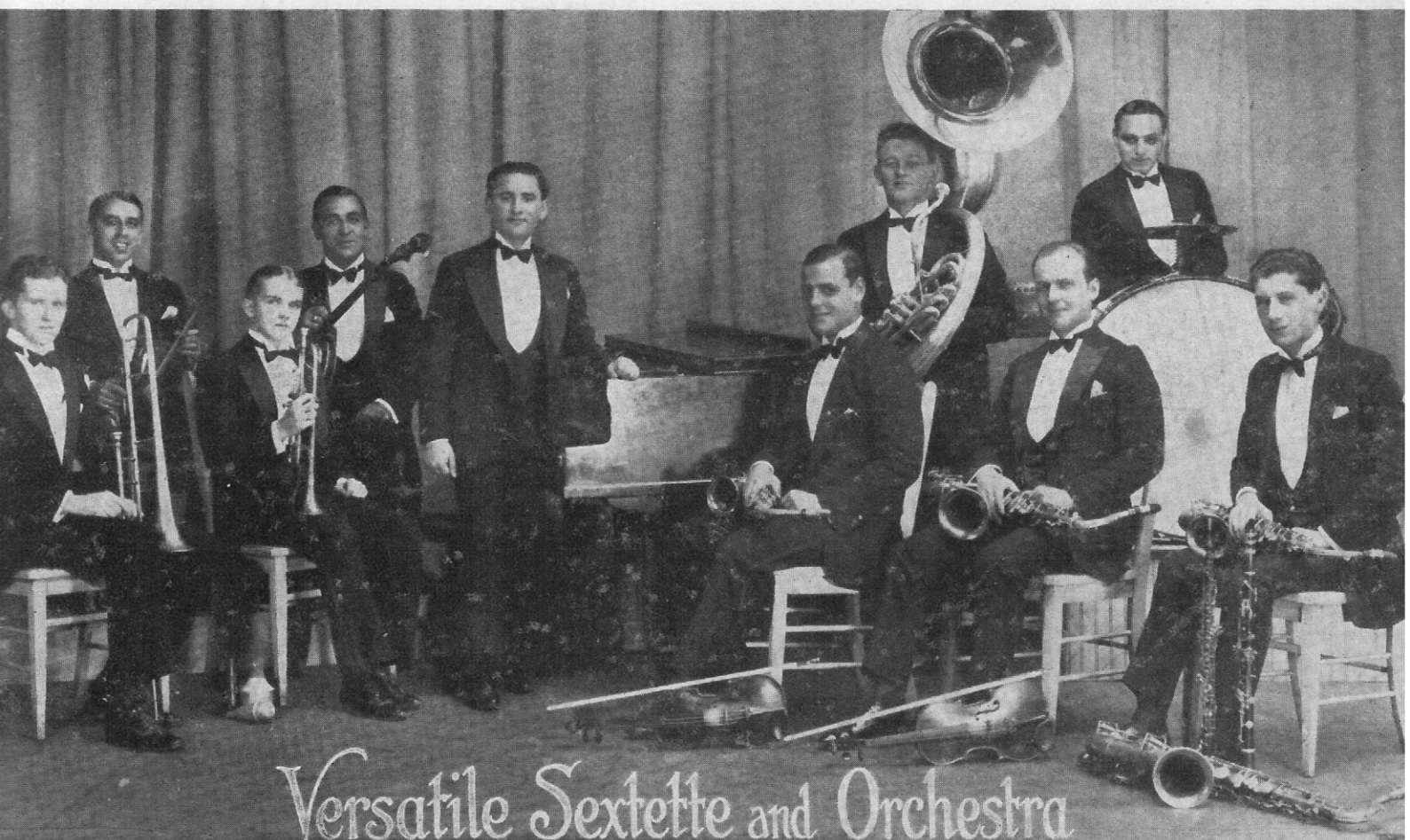
Versatile Sextette and Orchestra

Gotham Music Service 150 West 46 th St. New York City.