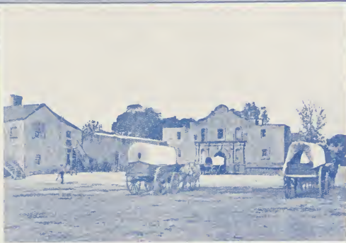
THE ALAMO, 60 YEARS AGO