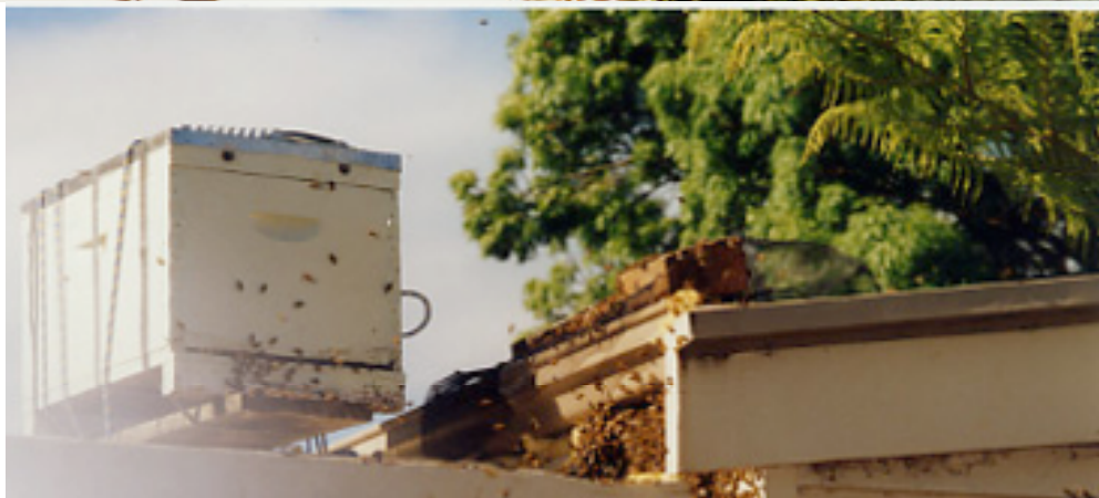
Figure 3. Hive body in position to attract bees trapped outside of wall.