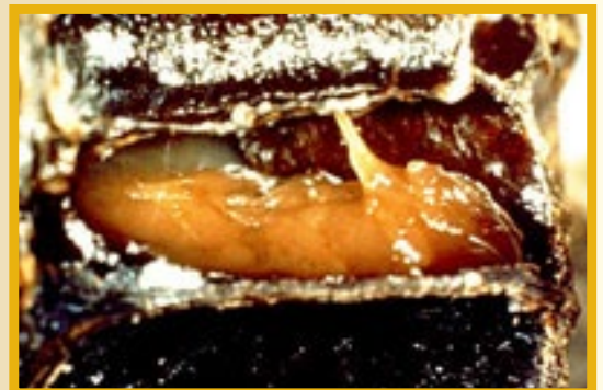
AFB infected brood may exhibit a syndrome called ‘pupal tongue’ where the tongue protrudes to the top of the cell.