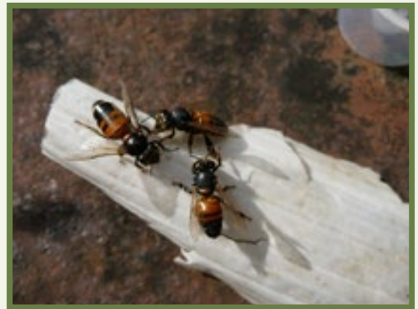
Chronic Bee Paralysis Virus - three bees with typical CBPV "shiny appearance".