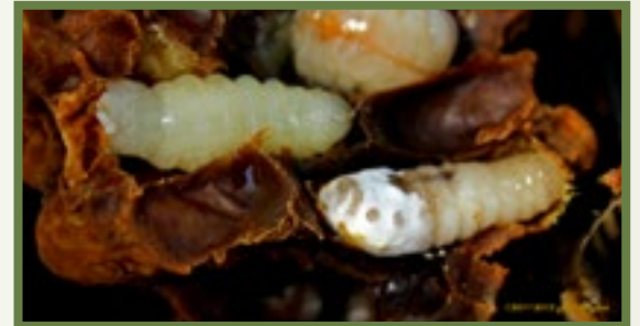
Chalkbrood taking over a drone larvae.