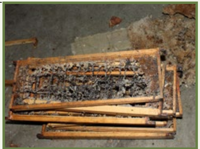
Frames with extensive wax moth damage.