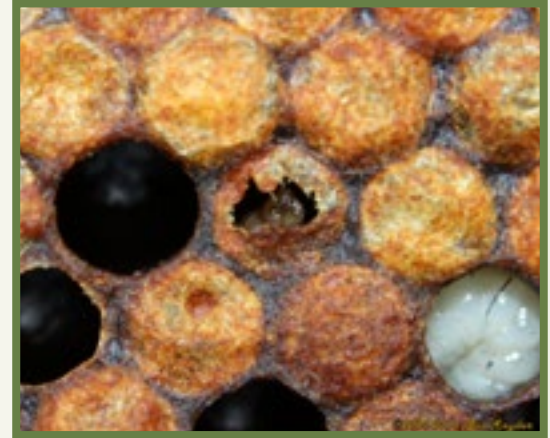
Sacbrood under a perforated cap.

The decomposed larval scale are dry, brittle, and easily removed from cell.