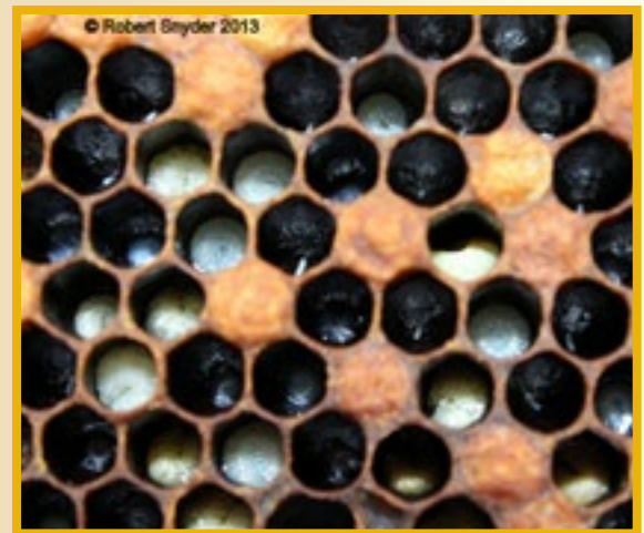
Larvae with early stages of EFB. One larvae displaying “stomach ache” (starting to contort in the cell) position.