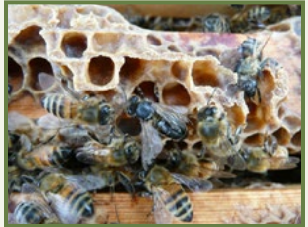
Chronic Bee Paralysis Virus - CBPV infected bee, bald and deformed wings.

Sick bees are usually seen trying to crawl up or falling down from the front of the hive.