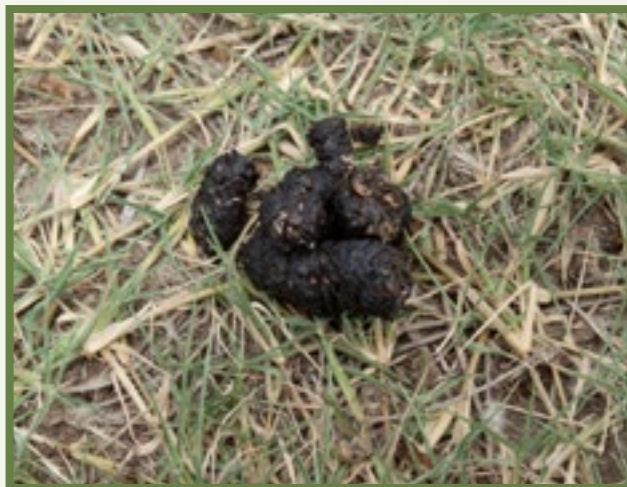
Skunk feces with bee parts in it is a good indication the skunk has been feeding on bees.

Chances of skunk-raccoon predation are higher when other natural food sources are scarce, or in larger apiaries.