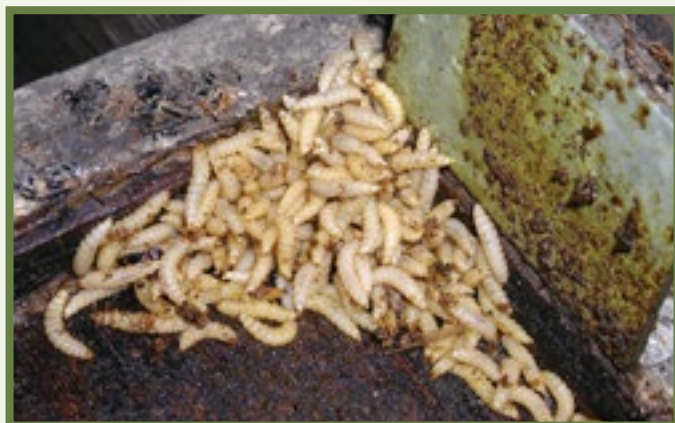
Small hive beetle larvae.

Infestations usually peak during late-summer months through the fall season in areas where beetles may be emerging from the soil.