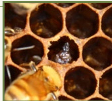
The black larvae is sometimes said to look like a "Chinese Slipper".

Sacbrood is a viral disease brought on by stress. The disease is most likely to occur in spring and early summer during stressful conditions such as cool temperatures, high humidity, and malnutrition. Sacbrood tends to disappear after conditions improve and especially after the main nectar flow has started.