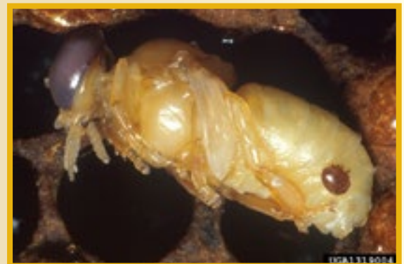
Adult female Varroa mite feeding on developing bee pupa.