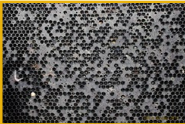
AFB — Deadout with spotty brood pattern.