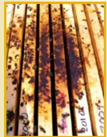
Nosema apis , excessive bee excrement with a handful of bees remaining that appear bloated and wet.