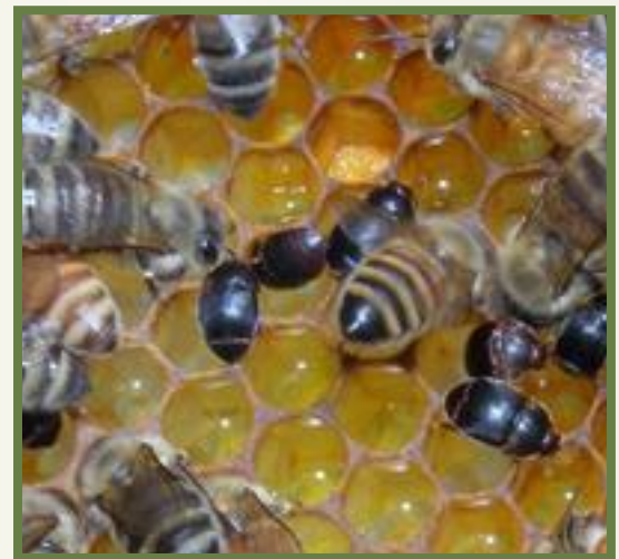
Small hive beetle adults.

SHB larvae eat everything in the colony (pollen, brood, honey, dead adult bees and combs) causing the honey to ferment and to become repellent to the bees and other scavengers as well.