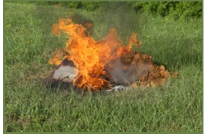
Burning an American Foulbrood infected hive.

Burning is a method used to control brood diseases, especially AFB and occasionally for EFB. Hives infected with these diseases must be destroyed or sterilized in order to prevent further spread of the disease.