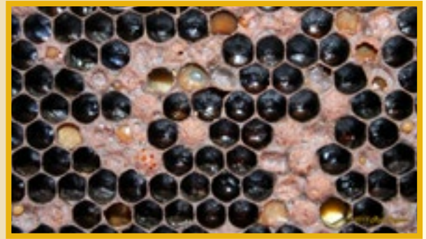
AFB — A colony heavily infected with AFB will have moisture on the sealed brood. Brood is also oozing from perforated cells at this stage.

Prior to the introduction of Varroa mites, American Foulbrood (AFB) was considered the most serious disease beekeepers had to contend with. AFB is a bacterial disease and is still a serious honey bee brood disease. AFB spores are transmitted to young larvae (less than two days old) while being fed by nurse bees. Immature bees die from this bacterial disease in the late larval or pupal stage and putrify in their cells. AFB is also spread by housekeeper bees and by beekeepers using or swapping contaminated equipment. Once a colony is weakened by AFB, robber bees may infiltrate the hive, steal infected honey, and bring it back to their own brood, thus spreading the disease. AFB spores remain viable indefinitely.