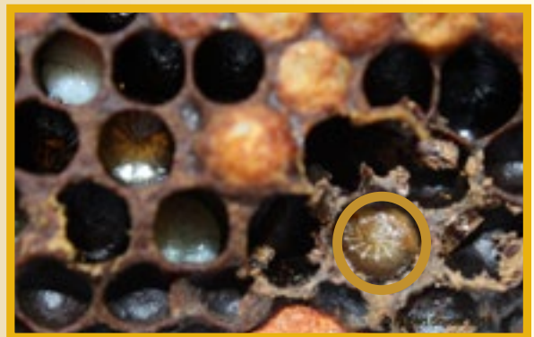
EFB larvae with sunken trachea visible (silvery lines on side).