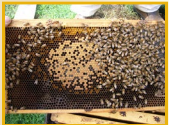
Colonies collapsing with a high rate of Nosema ceranae infection.