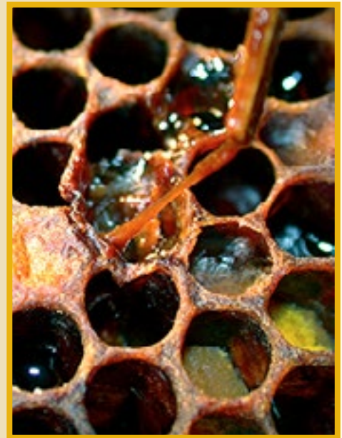
AFB — “Ropy” symptom.

There is often a spotty brood pattern (“shotgun”) of infected and uninfected cells.