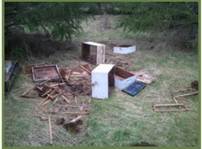
Evidence of a bear's visit to the beehive.

Damage to bee colonies is more likely to occur in early spring when bears come out of hibernation and in the fall before entering hibernation dens.