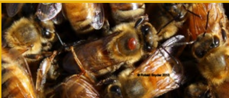
Varroa mite attached to female worker bee.