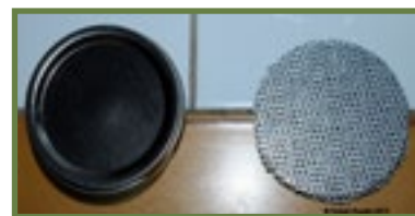
Example of lids used for sugar roll.