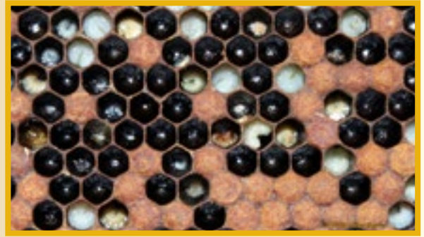
EFB larvae turning and decomposing (two cells with contaminated brood food).