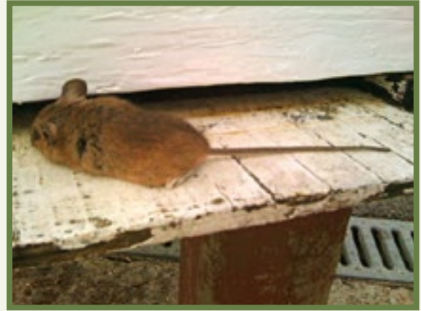
In the fall, mice will often try to move into accessible hives to establish a warm winter residence.

They tend to build their nests at the bottom of the hive and in corners away from the bee cluster to avoid getting stung.