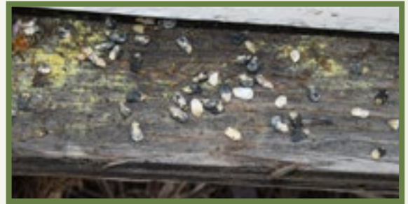
Chalkbrood mummies just outside the entrance of the hive entrance.