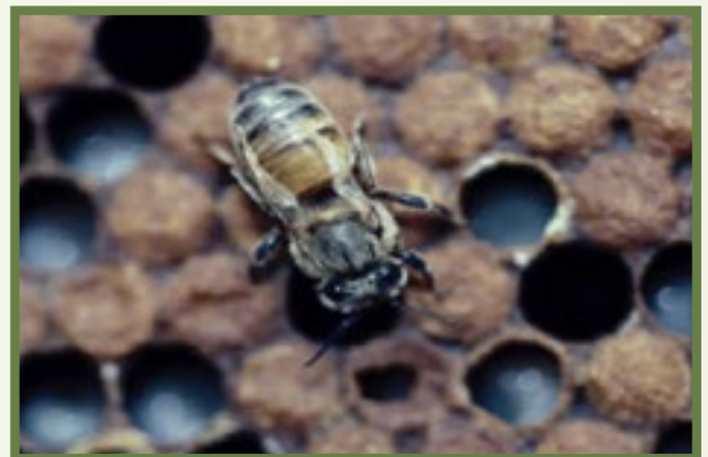
Deformed Wing Virus - The virus multiplies slowly which permits the infected bee to survive to adulthood. The newly-emerged adult has misshapen wings and dies.

Deformed wing bees may die off naturally as they approach foraging age, or are sometimes actively removed from the colony by house bees.