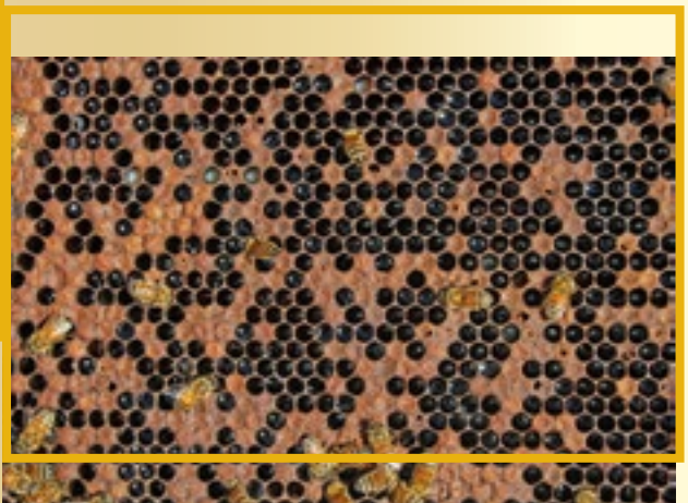
Spotty brood patterns (shotgun pattern) may indicate a Varroa mite infestation.