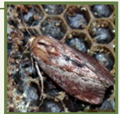
Greater wax moth.

Wax moths can be serious pests of stored wax comb. These pests typically do not directly destroy bee colonies, but they can infest stored equipment and stress colonies by forcing them to spend more time on comb maintenance.