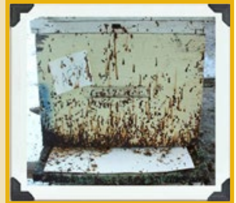
Hives lost to Nosema apis have symptoms of acute dysentery. Often there is excessive bee excrement at the front of the hive near the entrance(s).

Bees must be dissected and examined microscopically to confirm the presence of Nosema . Once a beekeeper gains experience and has received confirmation of Nosema , visual inspections may be enough to determine a Nosema problem.