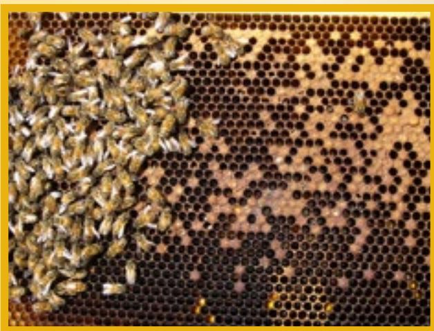
Shotgun pattern typical of a Nosema ceranae infection.