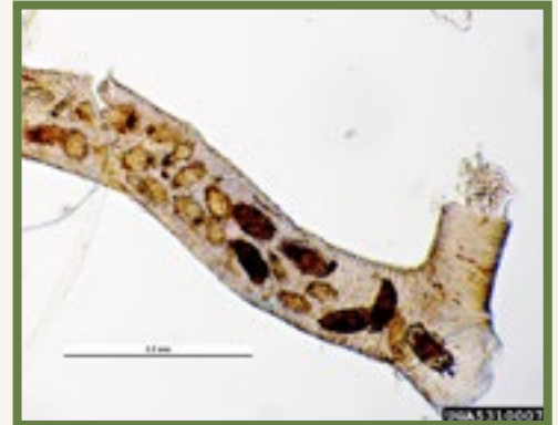
Mites inside tracheal tube.

Menthol crystals in pre-measured packets are one of the more effective natural controls for tracheal mites (applied according to directions). Synthetic pesticides are usually not necessary, and carry the additional risk of gradual contamination of the brood comb.