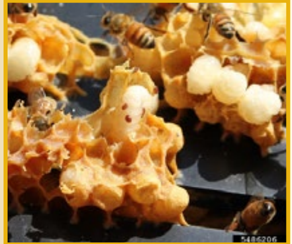
Varroa mites on drone pupae.

* The circulatory fluid, analogous to blood and lymph in humans.