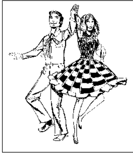
PROPER ATTIRE CLUB DANCE