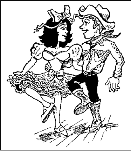
PROPER ATTIRE THEME PARTY