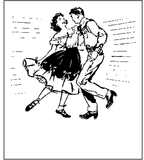
PROPER ATTIRE CONVENTION